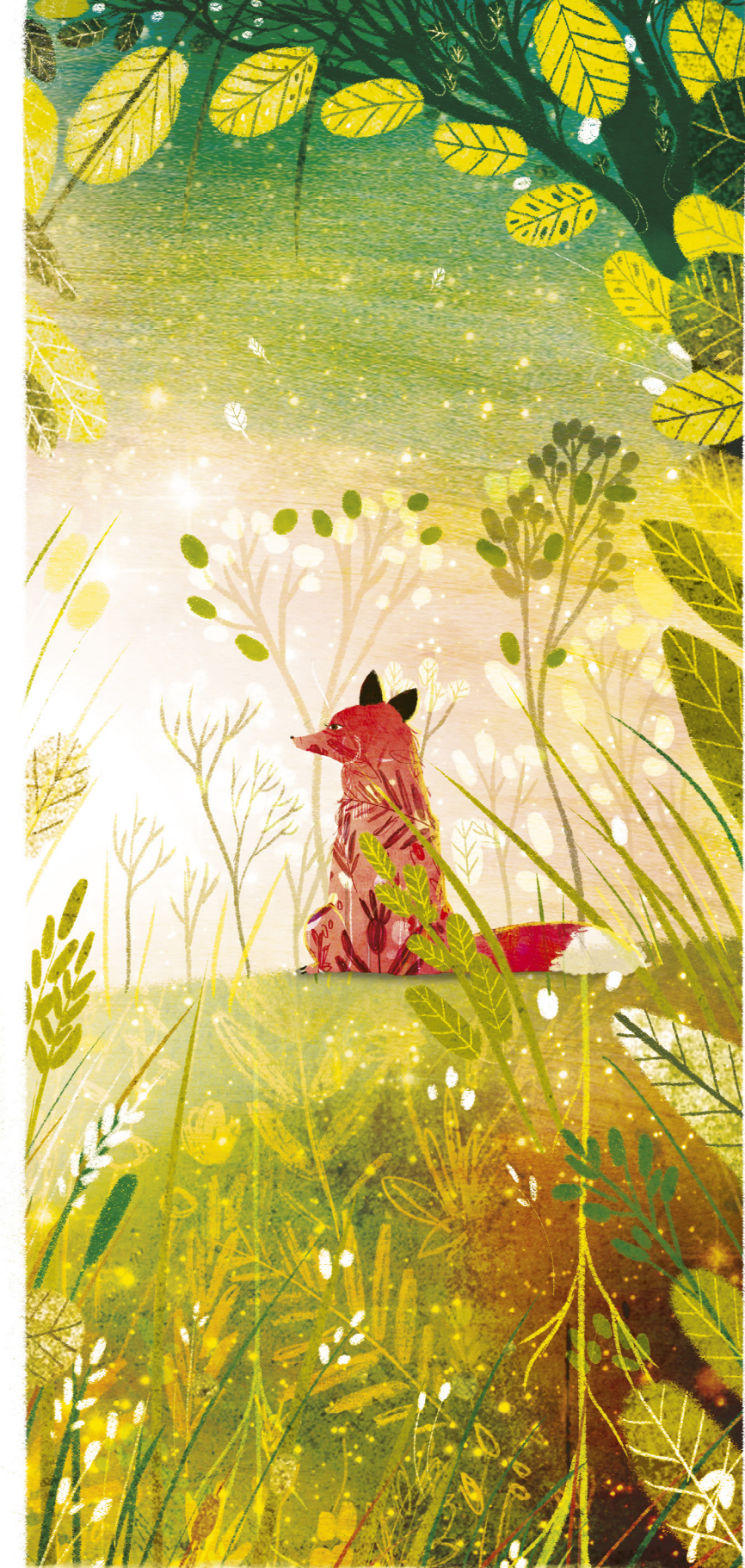
Leaf before fruit.