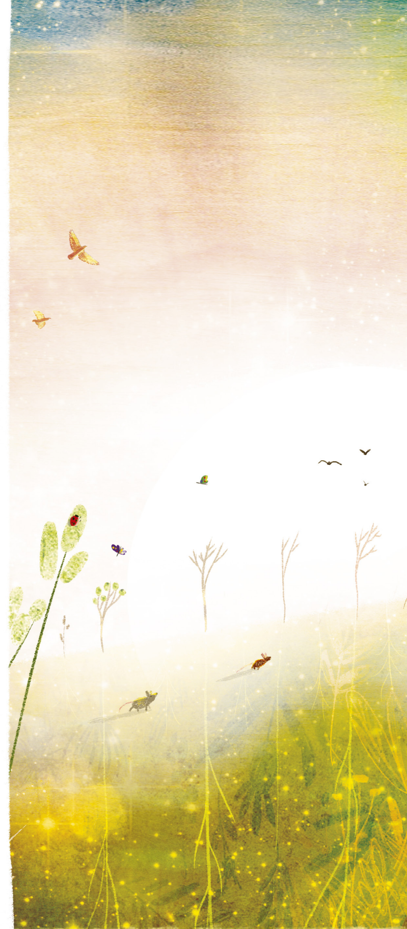
Stem before flower.