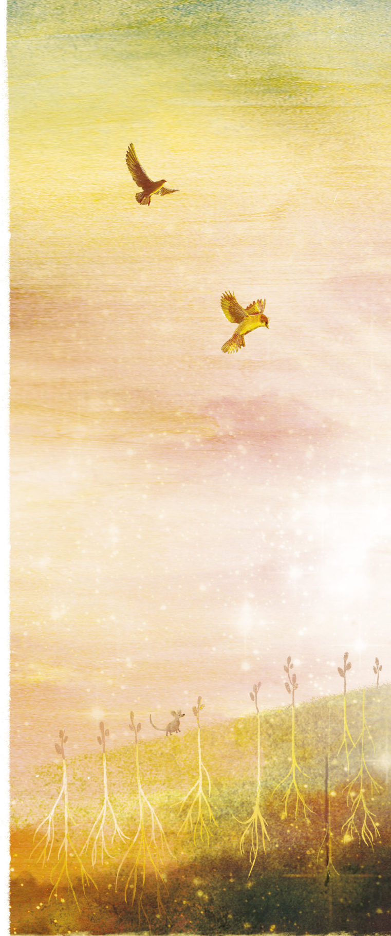
Roots before shoot.