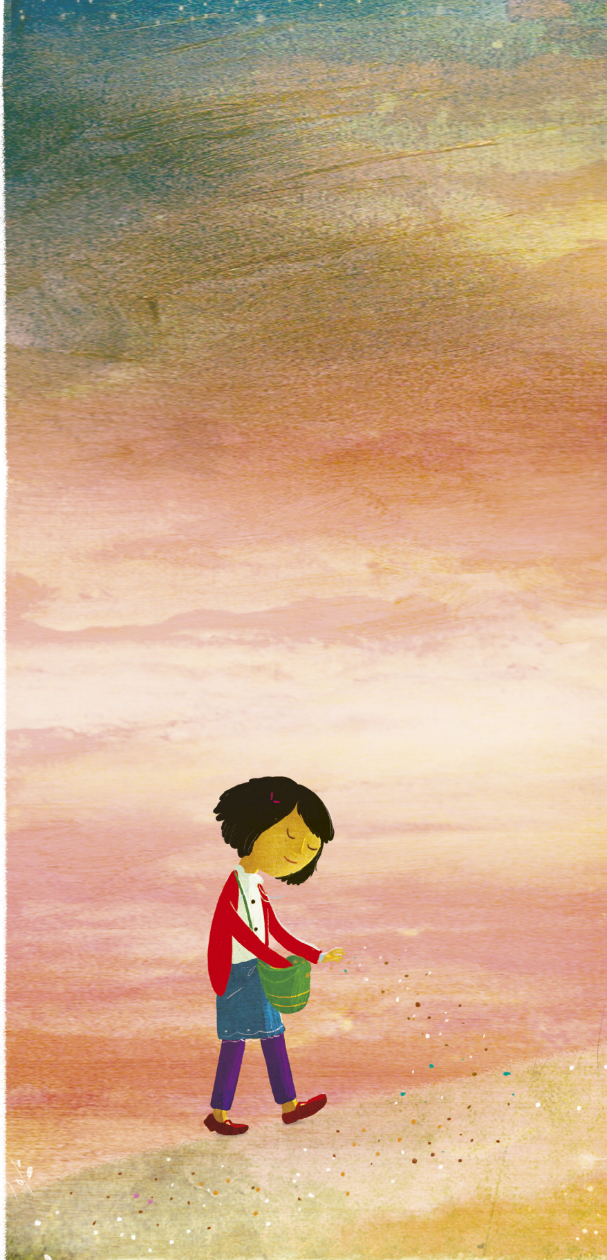
Sowing and planting.