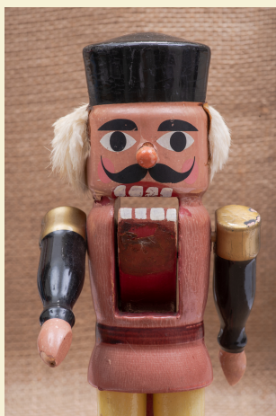
Wooden and painted