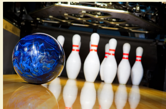
A bowling alley