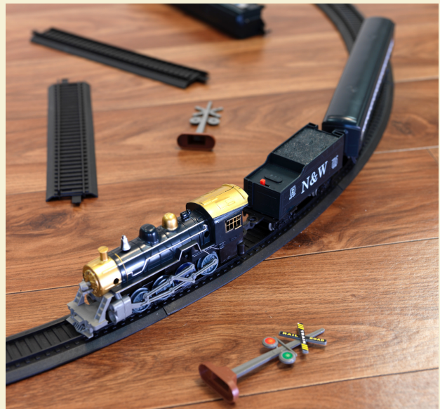
Train on a track